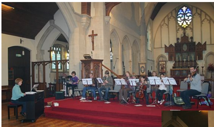
The music group playing at an 11.15 service

The Church is affiliated to the Royal School of Church Music and has a strong music tradition with a superb organist, three-manual pipe organ and a robed choir of 16 men and women and several others who join it for special occasions. Children in the choir are prepared for the RSCM examinations. The choir takes part in Diocesan, Deanery and RSCM services and is invited to take part on other musical occasions. The choir has links with choirs in Germany and Denmark. A group of