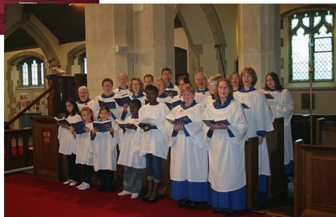
St Michael's choir

instrumentalists, both youth and adult, drawn from the congregation, accompanies the 11.15 and other services.