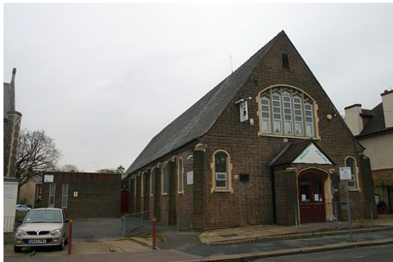
St Michael's Hall

Surestart Children's Centre during weekdays; the Church rents out this hall to other local groups during evenings and at the weekends and also uses the facilities for some of its own activities at these times.